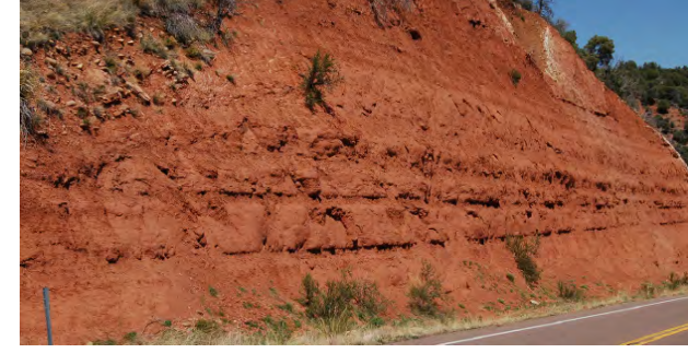
Outcrop of the Supai formation on Highway 60, south of Carrizo, Arizona

Thick evaporate deposits in Supai Formation below shallow marine Fort Apache Limestone